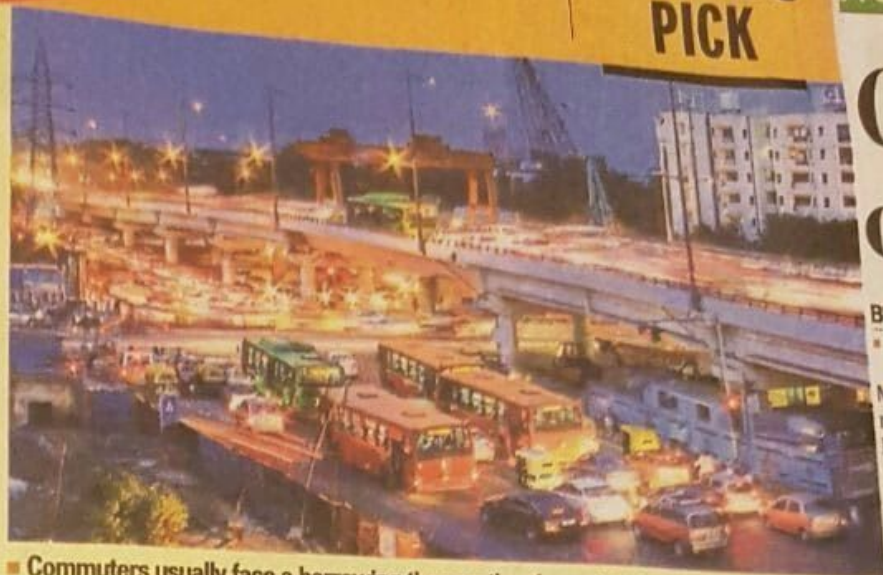
Commuters usually face a harrowing time on the clogged Ashram flyover.

The Kalindi Kunj bypass project – from DND Flyover to Badarpur border – which has been pending for 16 years is back on track. The signal-free stretch will help decongest Mathura Road and Ashram Chowk